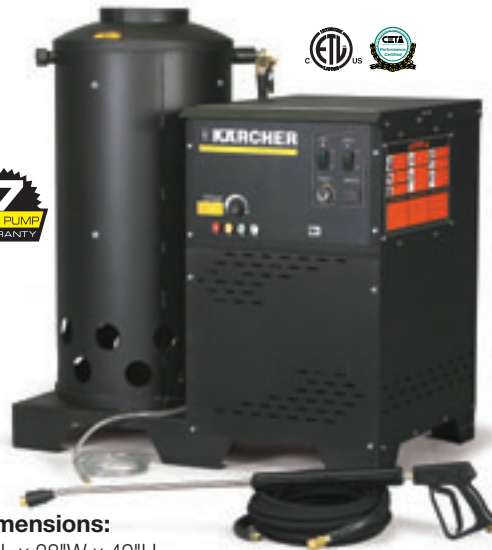
Dimensions: 44"L x 28"W x 49"H