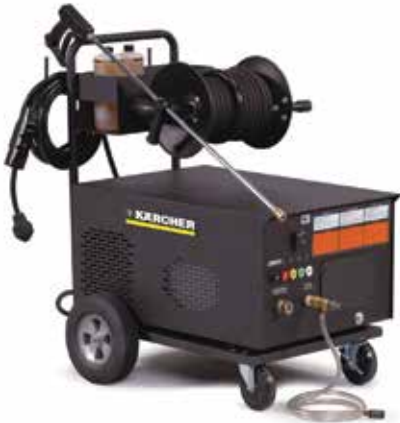
Wheel Kit with detergent rack and optional hose reel

Our cold-water cabinet units really take the heat, accepting heated water up to 180°F. Protected in durable steel cabinets, they demonstrate industrial strength throughout, including belt-drive Kärcher crankcase pumps, industrial Baldor motors, and magnetic starters for operator safety. All models are ETL certified to UL and CSA safety standards.