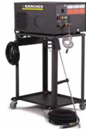
Floor stand with caster wheels