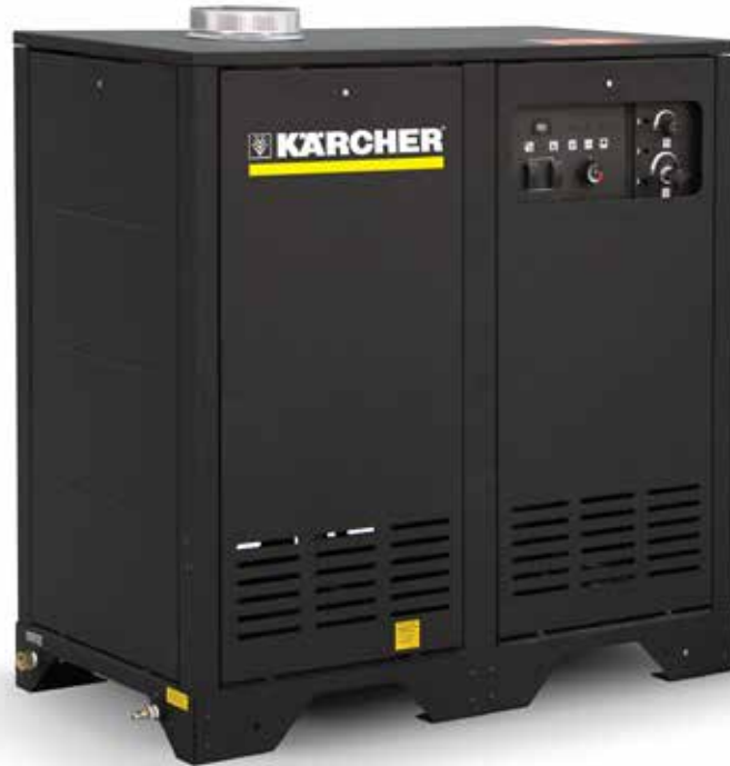
Shown with optional steam combo

The innovative, rugged design of the new Kärcher Liberty HDS natural gas and LP-heated cabinet pressure washer delivers up to 9.5 gpm at 3,000 psi of industrial power. Built in the U.S.A., each model is constructed with anodized structural rivets, Baldor industrial motors and Kärcher pumps that are backed by a 7-year warranty. All models are ETL certified to UL and CSA safety standards.